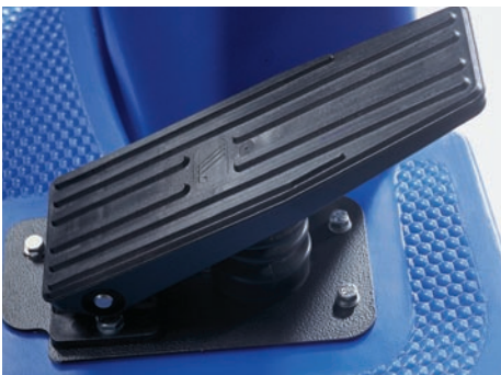
Variable speed non-skid pedal controls operator speed for precise cleaning.