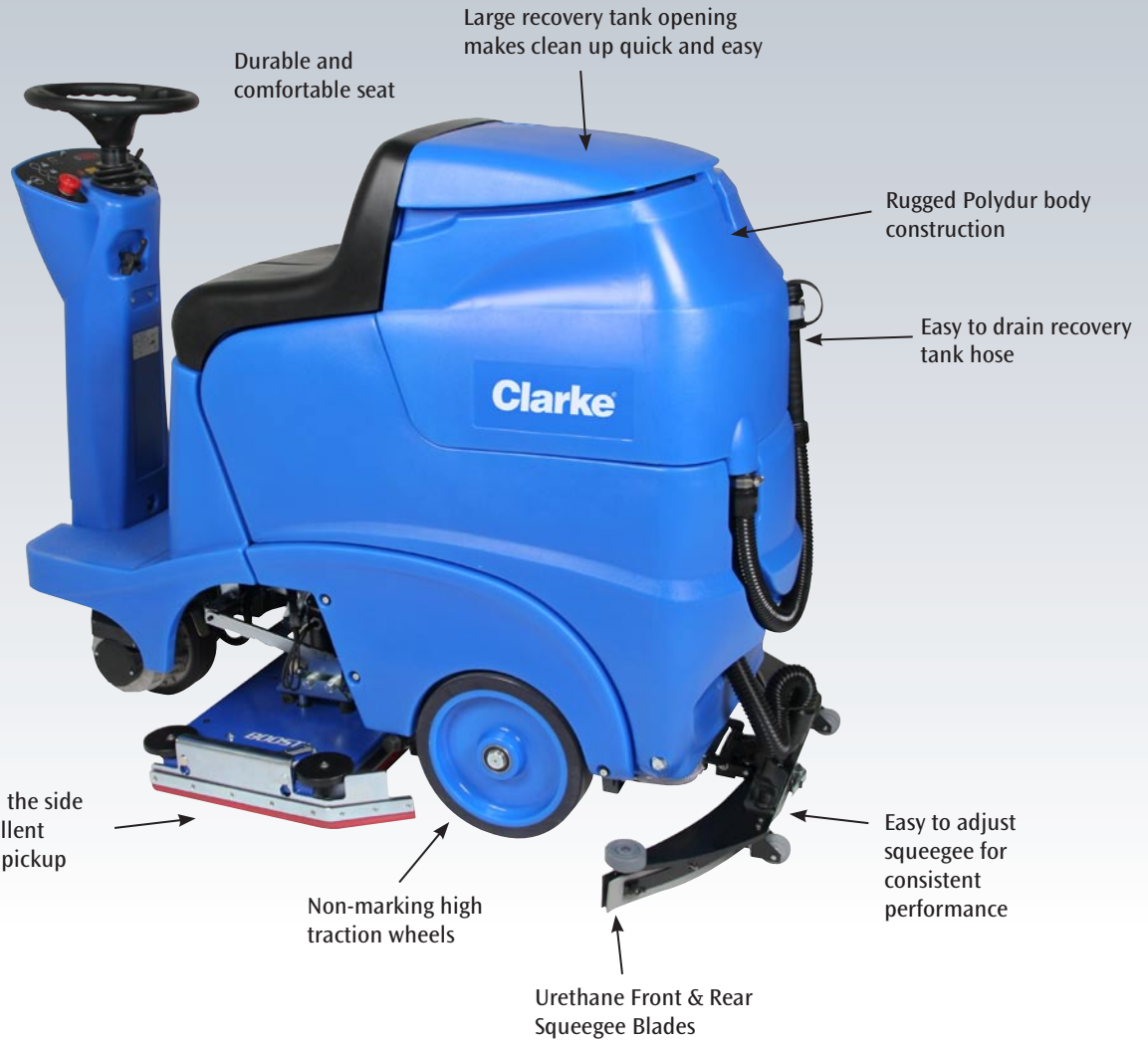
Durable and comfortable seat