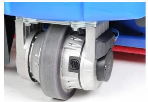
High traction tire for double scrubbing tough soils.