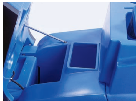
The solution tank opening is located directly under the flip-style seat. The recovery tank is up top and is easily drained by a hose located on the back of the machine.