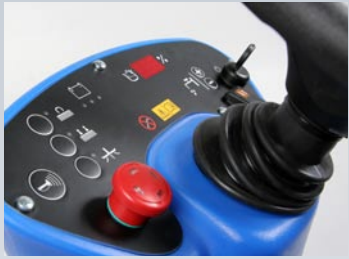
Universal one-touch controls and digital solution level indicator makes the CR28 BOOST Rider easy to operate.